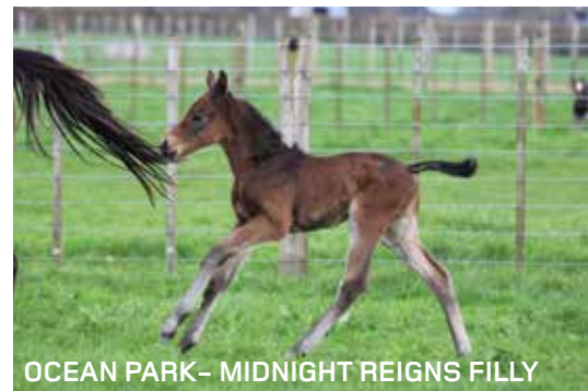
OCEAN PARK – MIDNIGHT REIGNS FILLY