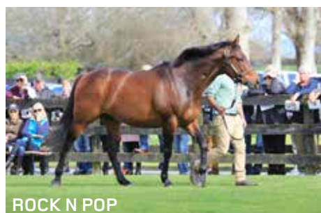
ROCK N POP