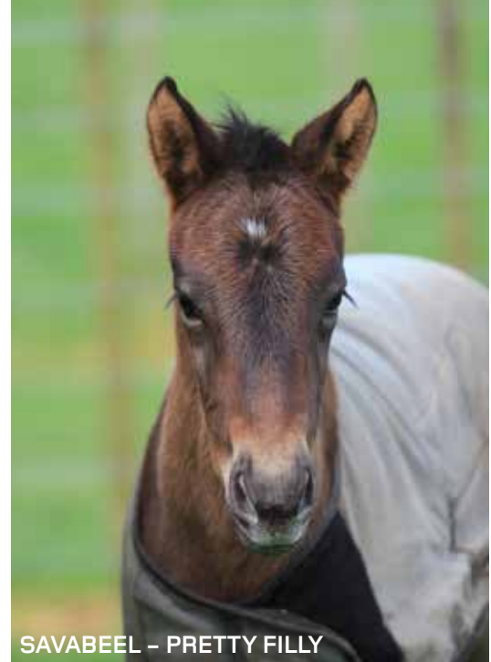
SAVABEEL – PRETTY FILLY