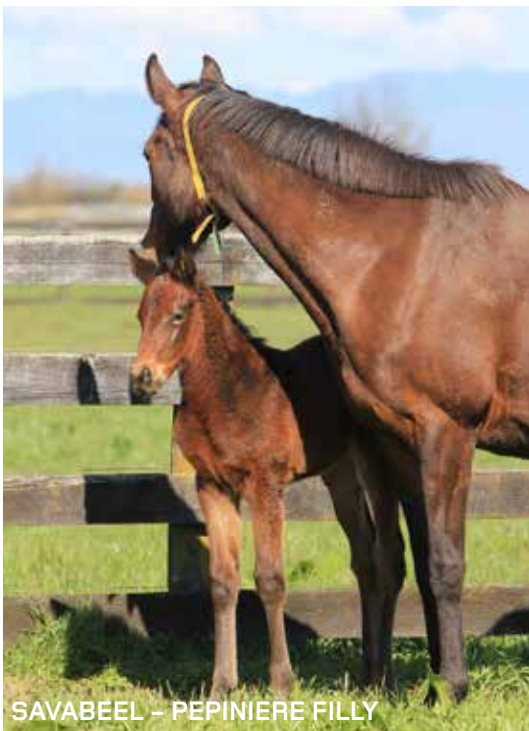
SAVABEEL – PEPINIERE FILLY