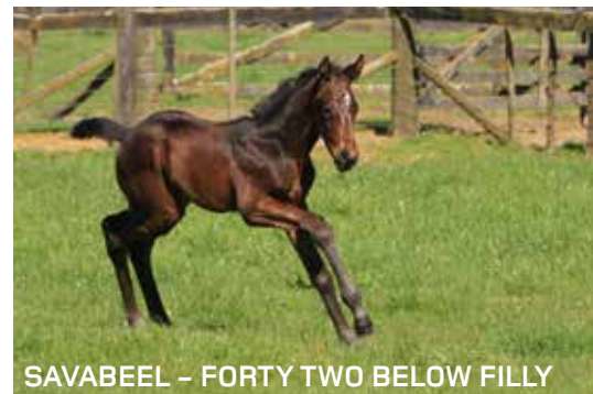
SAVABEEL – FORTY TWO BELOW FILLY