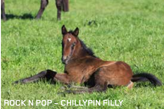
ROCK N POP – CHILLYPIN FILLY