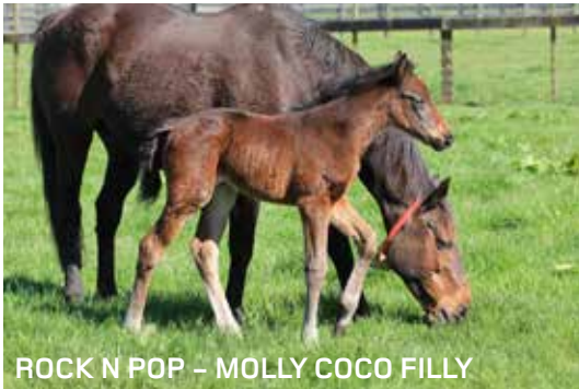
ROCK N POP – MOLLY COCO FILLY