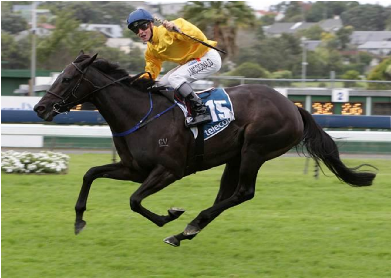
Star O'Reilly filly Silent Achiever winning the 2012 Gr.1 New Zealand Derby